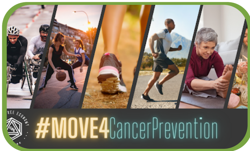
#MOVE4CancerPrevention promotional material

CEHN helped plan and lead #MOVE4CancerPrevention, a healthy and fun awareness-building movement event for the whole family to enjoy and every community to join. This inaugural event took place during National Cancer Prevention Month and was the first movement event focusing on removing cancer-causing chemicals from the places we work, live, and play and encouraging everyone to take action to prevent cancer.