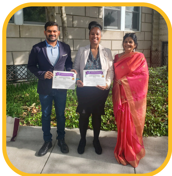
CEHN & Mann Deshi mark one of the first collaborations of Global Children's Environmental Health Network

CEHN is the co-founder and primary leader of a large systems effort, America's Climate Equity Collaborative. This multisector, robust collaboration between NGOs, government, community organizations, and the private sector launched to the public in the fall of 2022. This framework is designed to transform the way communities co-create, engage, and act on critical climate issues while disrupting disparities in environment-related health risks for children.