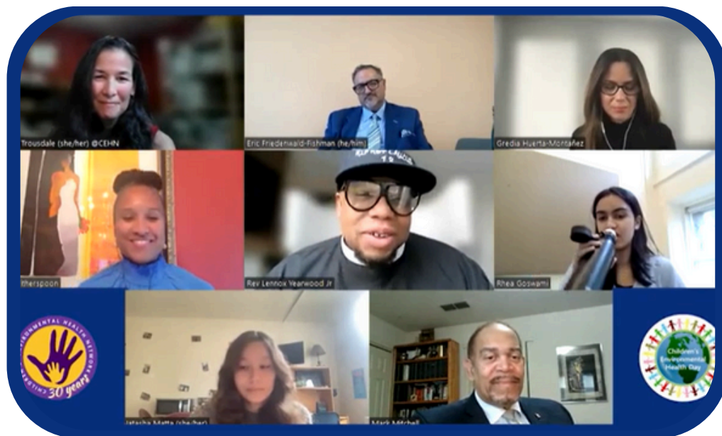
Screenshot of the 2022 Child Health Advocate and NOW Youth Leadership Awards