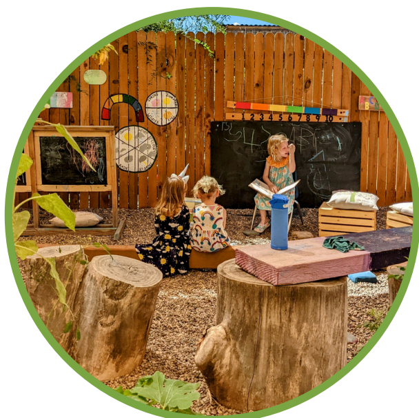
Children at an EHCC Endorsed Facility

EHCC is surveying endorsed child care providers to gather data on satisfaction with the endorsement program--utilizing Listen 4 Good consultants and survey tools. The JPB Foundation is offering these services for free to its grantees.