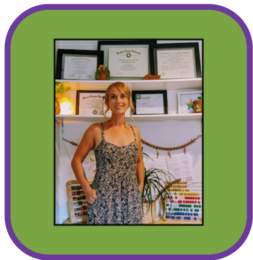
An EHCC Endorsed Provider