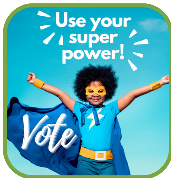
Voter Guide promotional material