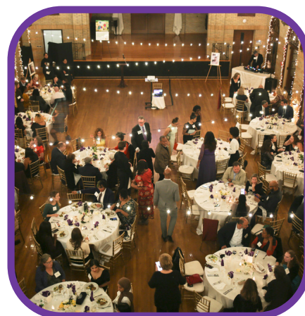
Photos from the gala, left to right: Staff family members celebrating on the dancefloor Local youth artists featured at the event Overhead view of dinner