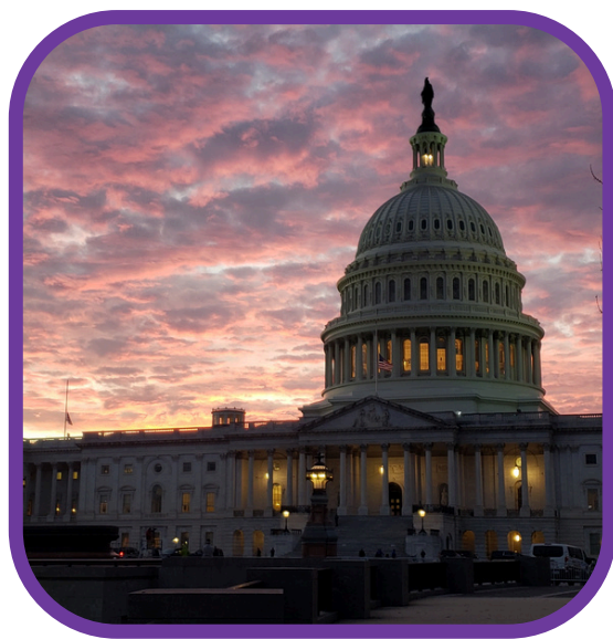
US Capitol Building at Sunset

CEHN, GreenLatinos, and The Wilderness Society launched and continue to co-lead the America the Beautiful for All Coalition (ATB4A). ATB4A reflects the diversity of America and centers the voices of people of color working to conserve 30% of lands, waters, and oceans, by 2030. This coalition will continue to motivate urgent action by the Biden administration and other decision-makers in support of the coalition's twin goals of conserving at least 30% of land, water, and ocean by 2030 and implementing a Justice40 metric for the America the Beautiful Initiative to ensure at least 40% of investments are made in communities of color and frontline communities that have historically seen little to no investment in conservation and equitable access to nature.