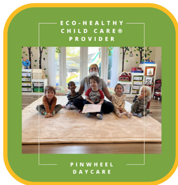
Children at an EHCC Endorsed Facility

EHCC created a web page highlighting partners' work to create safer and more eco-healthy child care settings. Partner activities include supporting providers in adopting eco-healthy best practices via training, resource sharing, and becoming an endorsed provider. Partners currently highlighted include: All Our Kin, Helen R. Walton Children's Enrichment Center, National Association for Family Child Care, National Association for Regulatory Administration, National Center for Healthy Housing, National Resource Center for Health and Safety in Child Care and Early Education, University of Maryland, and Women for a Healthy Environment.