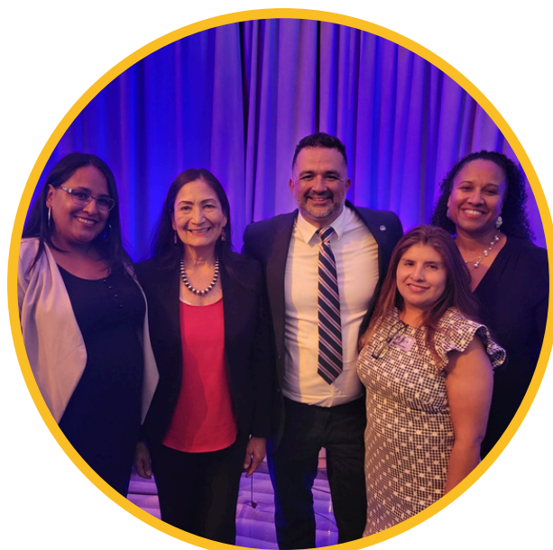
Secretary Haaland, Panelists, and ATB4A Members