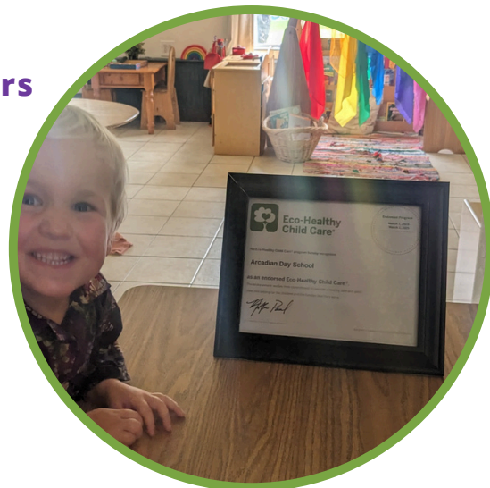
A Child at an Endorsed Facility

The second Getting Ahead of Lead Network was launched, targeting state leaders within the National Association for Family Child Care. The Network builds leadership within the family child care field and is made up of racially and geographically diverse providers committed to protecting children's health from environmental hazards. Network members completed over eight hours of training in environmental health.