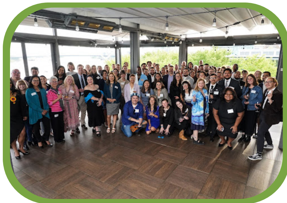
Members of the America the Beautiful for All Coalition

two co-chairs. It secured two co-leads for the six inaugural coalition workgroups - Priority Projects & Campaigns, Ocean, Freshwater, Public Lands, Urban Parks & Greenspace, and Wildlife. Workgroups also developed their policy recommendations through Fall 2022 for the debut of the first annual policy agenda that launched on the second anniversary of Executive Order 14008, which established the national 30x30 goal and subsequent America the Beautiful Initiative in January 2023. The policy agenda included legislative and administrative recommendations for the year ahead and had state or local policies relevant to the steering committee's decision-making process.