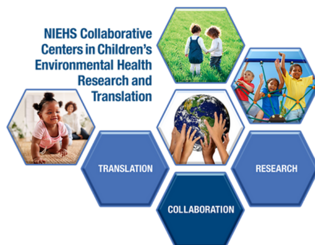
CEHRT Network logo