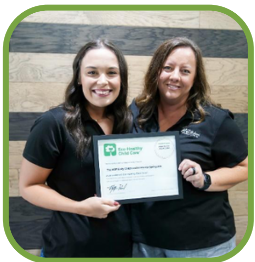
EHCC Endorsed Providers

eco-healthy best practices with their standards. We worked with the National Resource Center for Health and Safety in Early Care and Education to update cleaning, sanitizing, disinfecting, and indoor air quality best practices and embedded them within national child care health and safety standards.