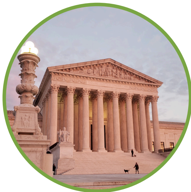
US Supreme Court at Sunset